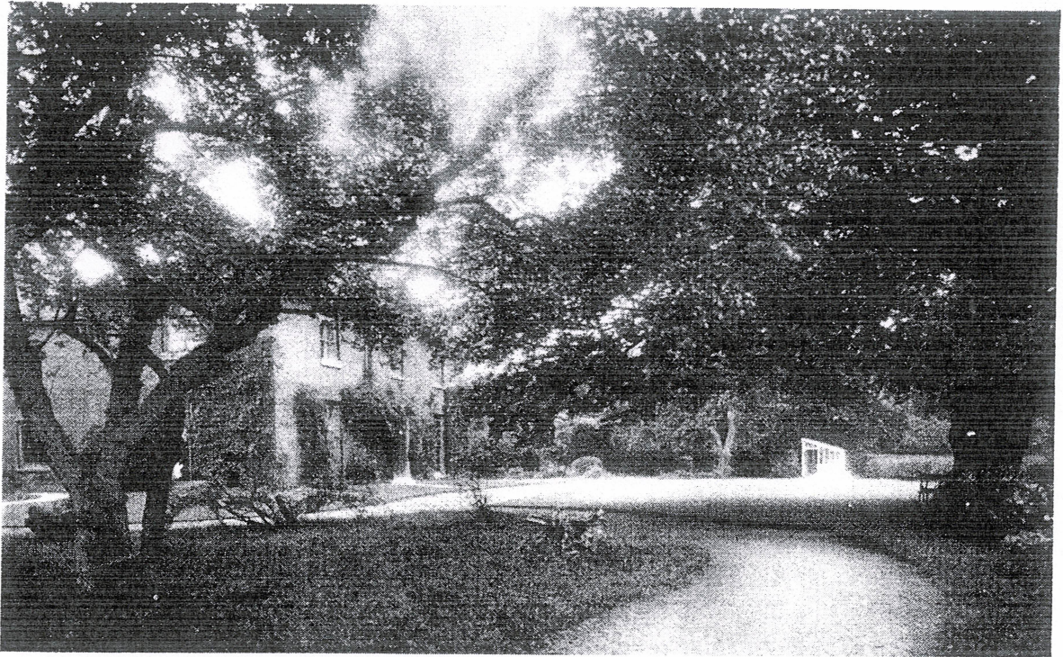
Lot 3. The Manor House, Sudbrooke