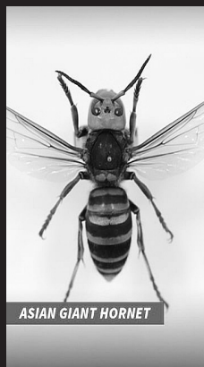
ASIAN GIANT HORNET