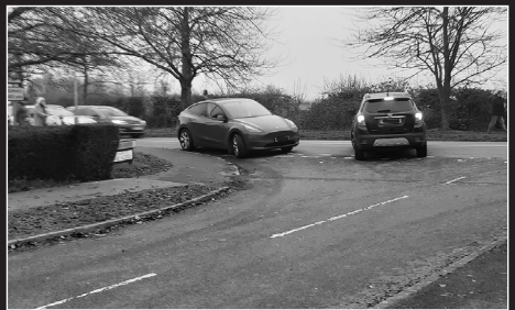
The image above shows one example of the bad parking, with this car parked right on the junction of Juniper Drive and facing the wrong way.