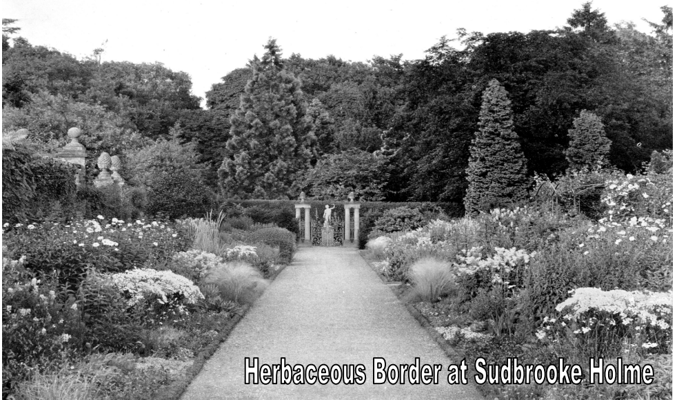
Herbaceous Border at Sudbrooke Holme