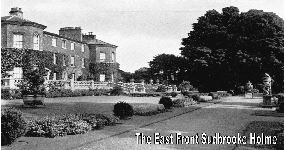
The East Front Sudbrooke Holme