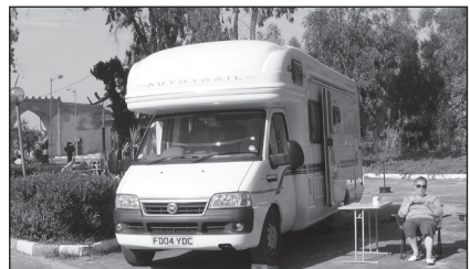
An African adventure pages 18-19